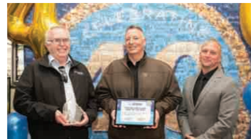
Large Host of the Year

Yancoal Australia Limited Moolarben Coal Operations