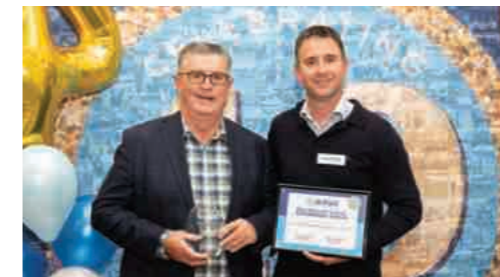
Local Government Award

Yancoal Australia Limited Moolarben Coal Operations