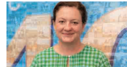
Recruitment Partner of the Year