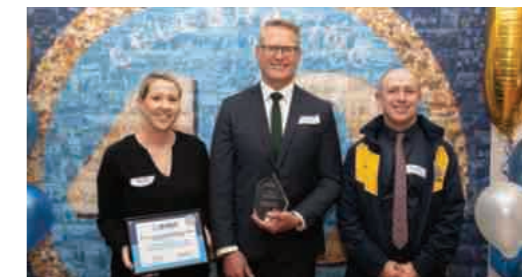
Career Development Partner of the Year