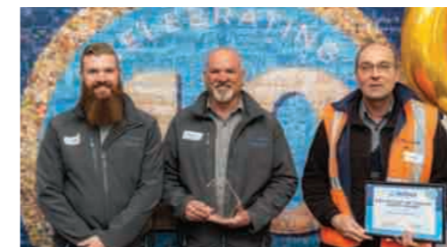
Jim Todman Safety Award