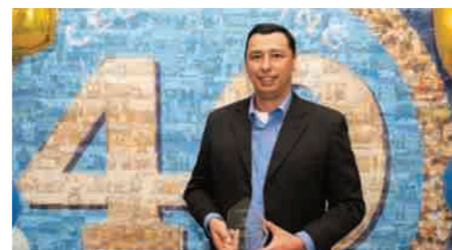
UpSkill Partner of the Year

Newcrest Mining Limited Cadia Valley Operations