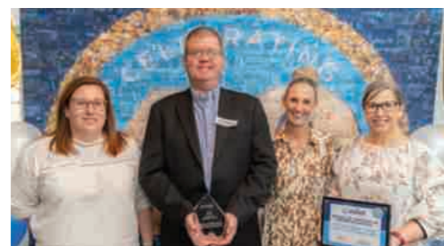
Mentor Plus Partner of the Year

Newcrest Mining Limited Cadia Valley Operations